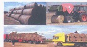
Biomass Derived Fuel (BDF)