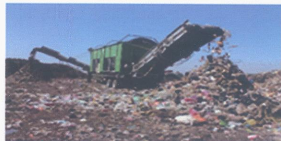
Open Dumps Sites