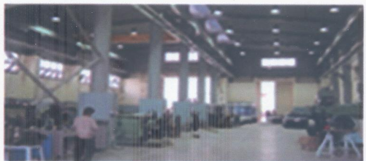
ENTAG Facility for Manufacturing