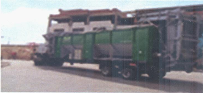
Mobile Screen Design & Manufacturing