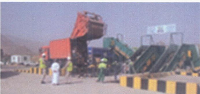
Supply of Transfer Station in Sultanate of Oman