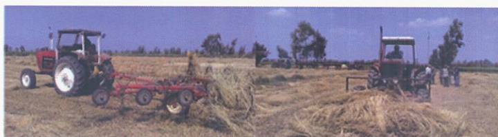
Collection & Transportation