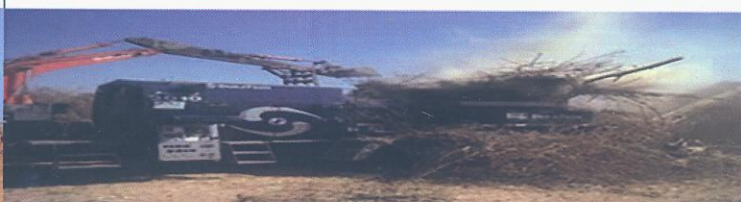
for Woody and Fibrous Biomass