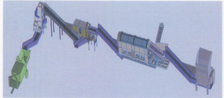
RDF Design Unit