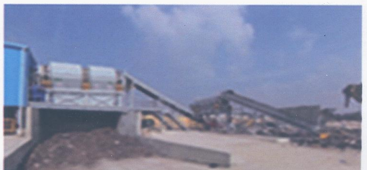
MRF-RDF project in Qalubia Governorate - GIZ