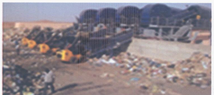
MSW Treatment Turnkey projects in Sudan