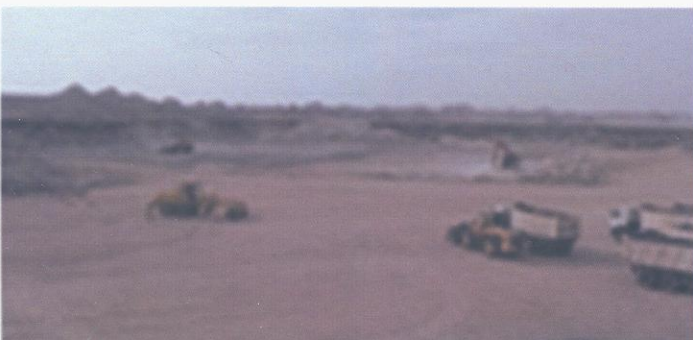
Design and Construction of Engineered landfill in Oman